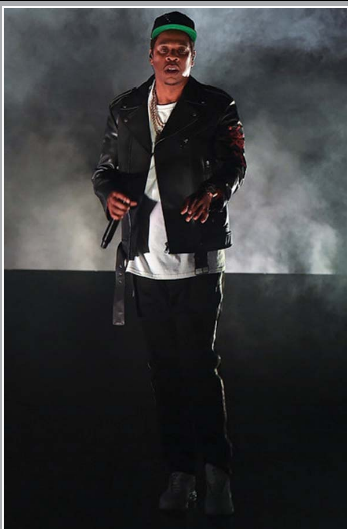
4:44! Jay Z delivering his big hits while bringing his 4:44 Tour to American Airlines Arena in Miami, Florida.

Best World Stage: Steve Aoki - Live from Isle of MTV Malta 2016, Kings of Leon - Live from Oude Luxor Theatre, Rotterdam, The Netherlands 2016, Tomorrowland 2017, DNCE - Live from Isle of MTV Malta 2017, The Chainsmokers - Live from Isle of MTV Malta 2017 [WINNER], Foo Fighters - Live from Barcelona, Spain 2017.