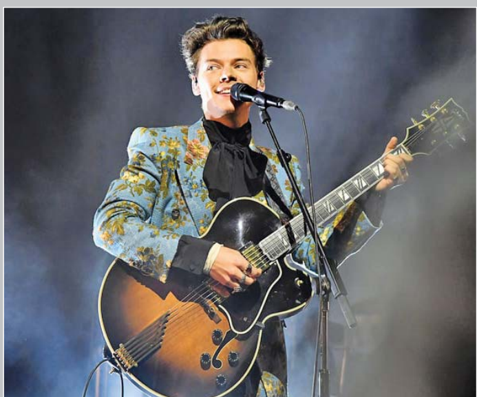
SWEET CREATURE: Former One Direction member Harry Styles performed at the Greek Theatre in L.A. as he embarks on his first solo world tour.

The fourth film boasts of a huge star cast including Parineeti, Tabu, Neil Nitin Mukesh, Sanjay Mishra and Johnny Lever while retaining the usual suspects - Ajay, Tusshar, Arshad, Kunal and Shreyas. The film is scheduled to release on October 20, 2017.