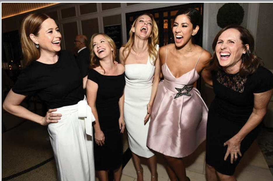
DAPPER GIRLS!: [L-R] Jenna Fischer, Angela Kinsey, Heather Graham, Stephanie Beatriz, and Molly Shannon attend the after party for the premiere of Momentum Pictures' "Half Magic" at The London West Hollywood in West Hollywood, California.

As per other updates, RGV has filed a case against the scriptwriter on the ground of plagiarism. He also announced on Twitter that he was going to file a case against a Telugu channel for distorting facts and providing misleading information. In other news, various Women Right groups are also protesting against this film - while some have vowed to go on a hunger strike, some want the filmmaker to be arrested as soon as possible.