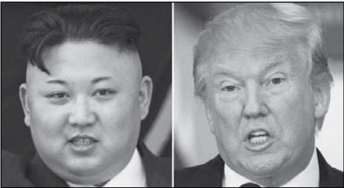
of war against us,” Foreign Minister Ri Yong-ho told Russia’s state news agency during an interview in Pyongyang yesterday. “Our dear supreme leader Kim Jong-un had already sternly warned: the US must act in a reasonable manner and cease

Moscow, Oct 12 (AFP): US President Donald Trump “lit the fuse of war” against North Korea with his provocative comments to the United Nations last month, North Korea’s foreign minister has told the Russian TASS news agency. Trump has engaged in an escalating war of words with North Korean strongman Kim Jong-un, trading insults amid rising tensions between the two nuclear-armed rivals. “With his belligerent and mad address to the UN, it can be said that Trump has lit the fuse