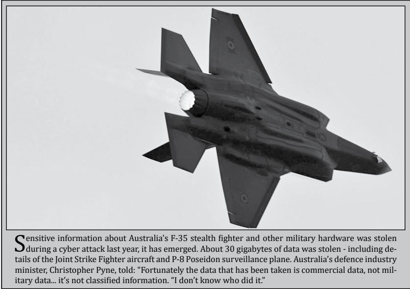
Sensitive information about Australia’s F-35 stealth fighter and other military hardware was stolen during a cyber attack last year, it has emerged. About 30 gigabytes of data was stolen - including details of the Joint Strike Fighter aircraft and P-8 Poseidon surveillance plane. Australia’s defence industry minister, Christopher Pyne, told: “Fortunately the data that has been taken is commercial data, not military data... it’s not classified information. “I don’t know who did it.”