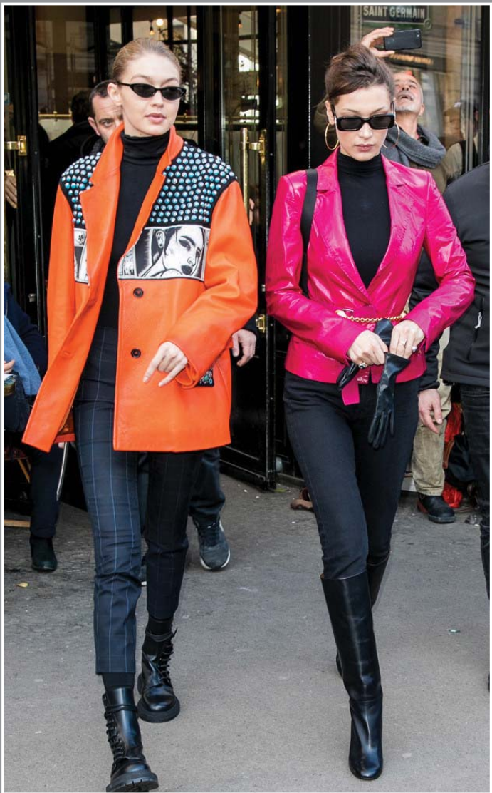
HADID SISTERS: Gigi Hadid and Bella Hadid look like they've stepped out of an Austin Powers film with their 60s color scheme.