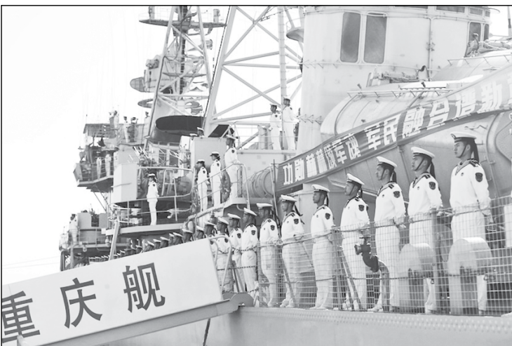
were aimed at testing weapons and honing the military's abilities in conducting coastal assaults and intercepting air targets. The ministry did not specify how long the drills were to last but a four-day shipping ban ending on Tuesday was issued for the area where the drills were held, according to notices by the military and local authorities.

Naval and air force assets including dozens of ships, more than 10 aircraft, submarines and an unspecified number of coastal defence personnel took part in the drills, which the ministry said