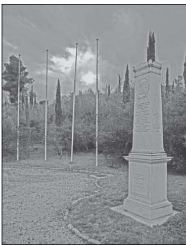
Monument dedicated to Olympic founder Pierre de Coubertin in ancient Olympia, southern Greece

As the Olympic movement contemplates change, Coubertin's legacy requires sober assessment.