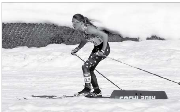
Rising global temperatures may make many cities too warm to host the Winter Games in the future.

In fact, Vancouver was touted as hosting one of the greenest Games ever. Some of this had to do with smart planning and the relative concentration of event venues in Whistler and Vancouver. But keep in mind that the Winter Olympics host fewer medal events and thus involve less movement of people overall.