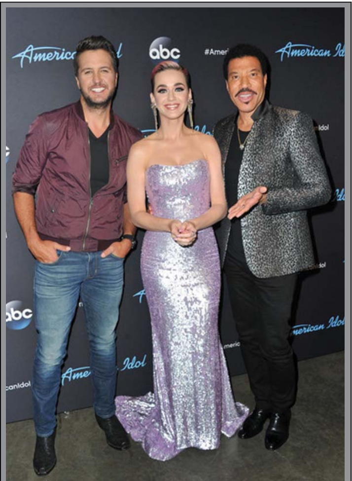
EXTRA TOUCH OF GLAM! Standing tall in a pair of open-toed heels, Katy Perry posed outside the studio with her fellow judges Lionel Richie [R] and Luke Bryan [L], who also stepped out in style.