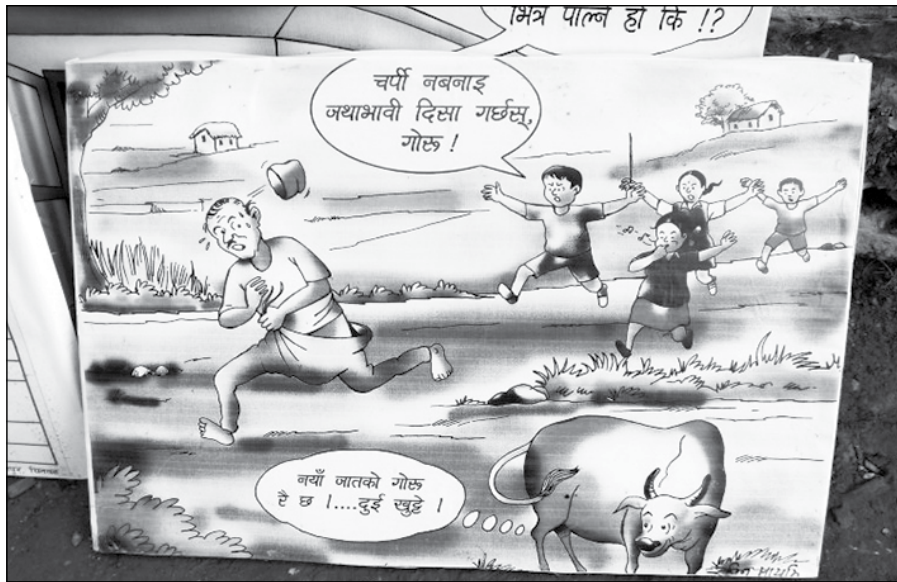
A banner in a Nepali village promoting safe sanitation, as open defecation is 'only for cows'.

This may seem like a sensible approach, but we and our colleagues suspected that some of these programmes use practices that adversely affect some people. In a new paper, we review 33 sanitation marketing programmes to understand what practices are used and the outcomes