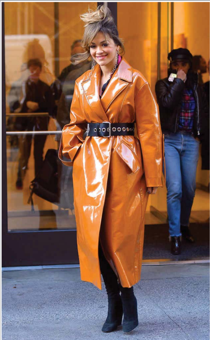
GLOSSY GAL! Singer and actress Rita Ora shines in an orange trench in NYC.

More details on the process by which the Academy's governors will be judged will be announced "in the new year", according to the email.