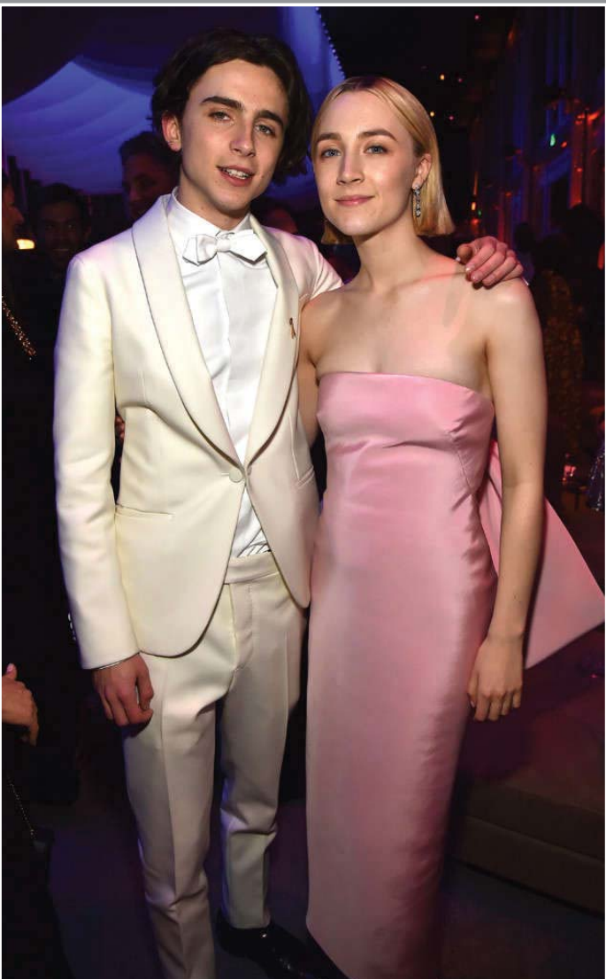
DOUBLE POWER: Academy Award nominees and Lady Bird co-stars Timothee Chalamet and Saoirse Ronan posed for a photo inside Vanity Fair's Oscars after-party.