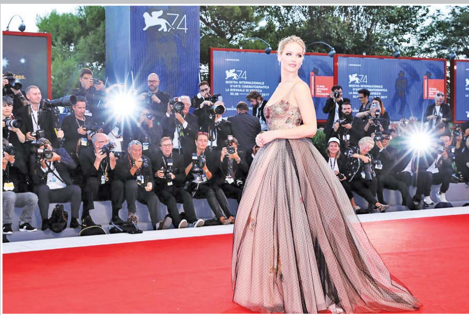
TURNING HEADS: Jennifer Lawrence stunned in a glamorous gown while walking the red carpet at the 'Mother!' screening during the Venice Film Festival.