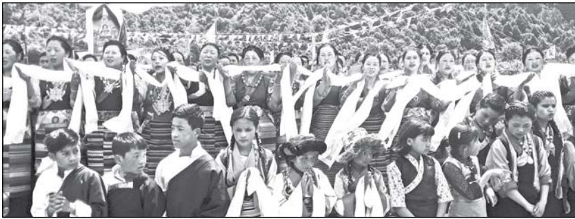
chungpa, as chief guest along with Sub Division-

The function was attended by Member of Parliament-Rajya Sabha, Hishey La-