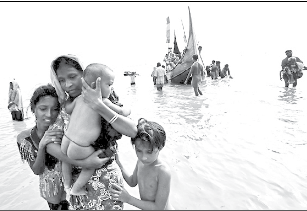
fresh upsurge in violence in Rakhine on August 25, many using small fishing boats unsuited to the rough coastal waters. Border Guard Ban-

Scores of people have already been killed attempting to cross the Naf border river since a