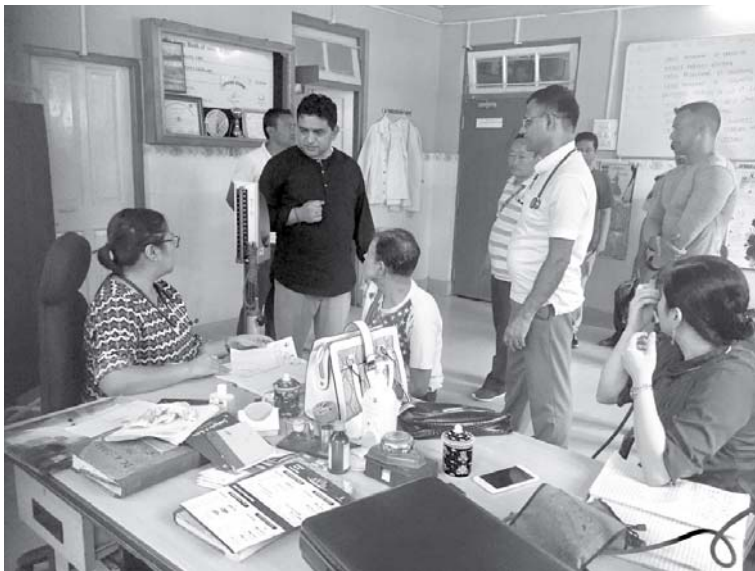
healthy life. The Minister was informed on various components of health centers by