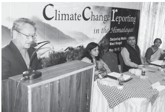
Education, Government of West Bengal.

The workshop is being organized by Centre for Media studies, Indian Himalayas Climate Adaptation Programme (IHCAP) of the Swiss Agency for Development and Cooperation (SDC) and Department of Science and Technology (DST) Government of India with Department of Science Technology and Higher