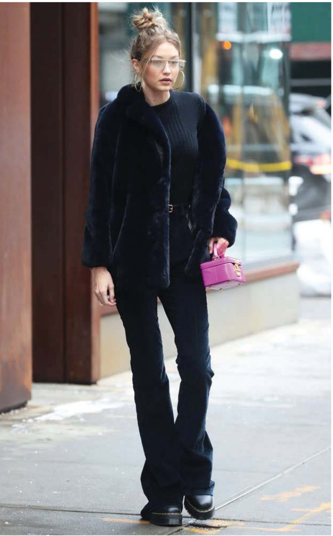
CITY SCENES: Supermodel Gigi Hadid heads out to run errands in New York City.

ARIES: A close friend or love partner may not be returning your calls, Aries, and your insecurities could well get the best of you, causing you to think your friend doesn't care anymore. Don't fall into this trap. Your friend is probably surrounded by a lot of demanding people who need assistance, and therefore isn't phoning anybody else. Be patient, distract yourself, and give your friend another call tomorrow. The response should be more immediate then! TAURUS: Do you have a date tonight with someone special, Taurus? If so, expect some delays. You might get tied up with doing your daily errands. This could be frustrating both for you and your partner, but you'll eventually touch base. Don't get so upset