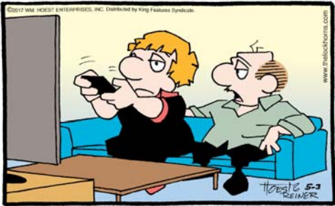
"YOU SAID I NEED TO SHARE THE TV REMOTE MORE ... YOU DIDN'T SAY ANYTHING ABOUT THE BATTERIES."