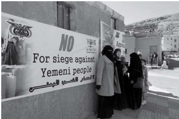
Yemeni women take part in a sit-in and a protest against the ongoing conflict in the Arab country, outside the UN offices in Sana'a, Yemen, 16 March 2017.

A woman from the Northern Ibb region, which is occupied by the rebel Houthi army, explained the situation to a research team: "We live in a state of lawlessness: no security, no protection and no functional law enforcement authorities. A person may be shot dead for a trivial thing. The security situation doesn't look like it did in the past. Now, there are informal groups behaving as if they were