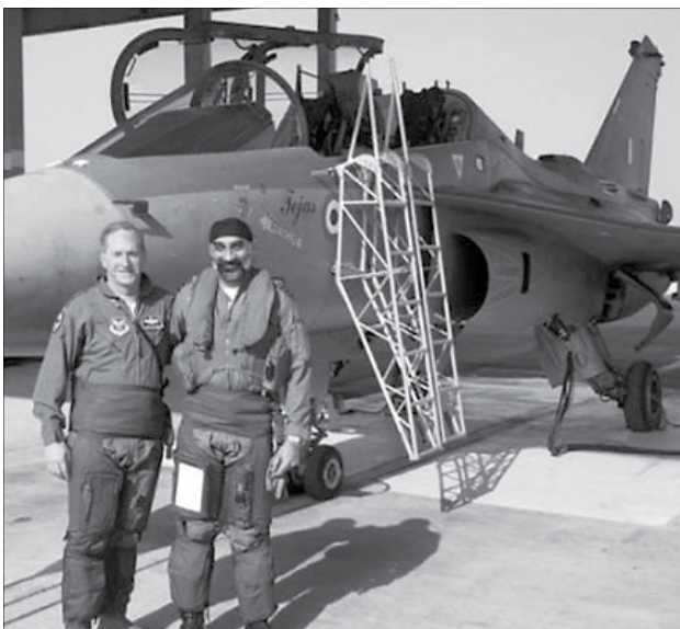
Earlier, General Goldfein had stressed on the "strong relationship" between the two air forces.

From February 26, international groups will present cultural programmes depicting the life and teachings of Sri Chaitanya MahaPrabhu culminating with the celebration of 'Gour Purnima' on March 2, the statement said.