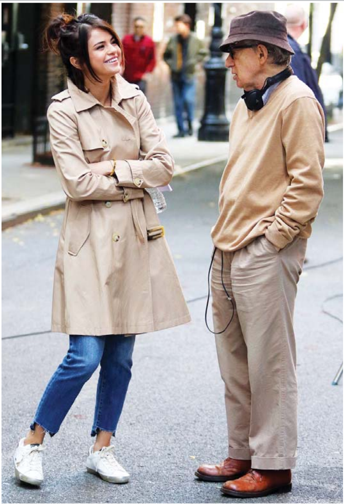
SELENA ON SET: Selena Gomez was spotted filming Woody Allen's new movie in Manhattan's West Village neighborhood recently.