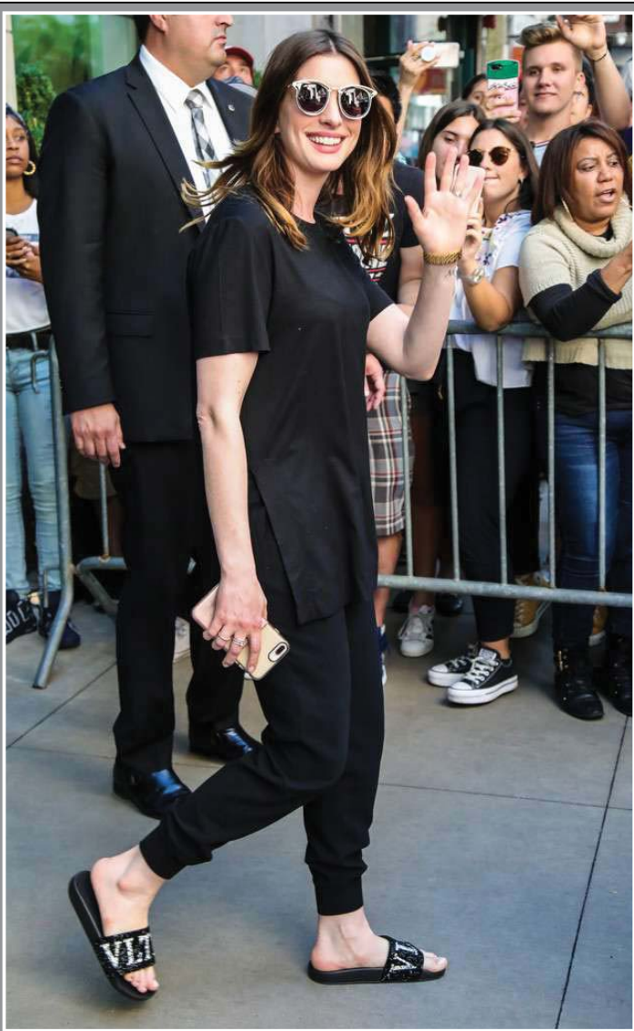
WELL HELLO! Ocean's 8 actress Anne Hathaway waves to fans while exiting her hotel in New York City.

DreamWorks has its own dragon-centric franchise in How to Train Your Dragon and will conclude that animated film series next March with the long-awaited third chapter, How to Train Your Dragon: The Hidden World. Dragons aside though, it thankfully doesn't sound like Dragon Empire and How to Train Your Dragon have much in common, either in terms of their cultural influences or lead (human) characters. Dragon Empire will further continue the recent trend in Disney animated films of focusing on a non-romantic couple and could make for another memorable fantasy heroine's journey in the vein of Moana, based on the details available at the moment.