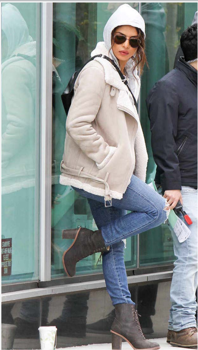
ON SET! Priyanka Chopra films scenes for Quantico in Queens, New York. She is also starring in two Hollywood projects scheduled to release next year.