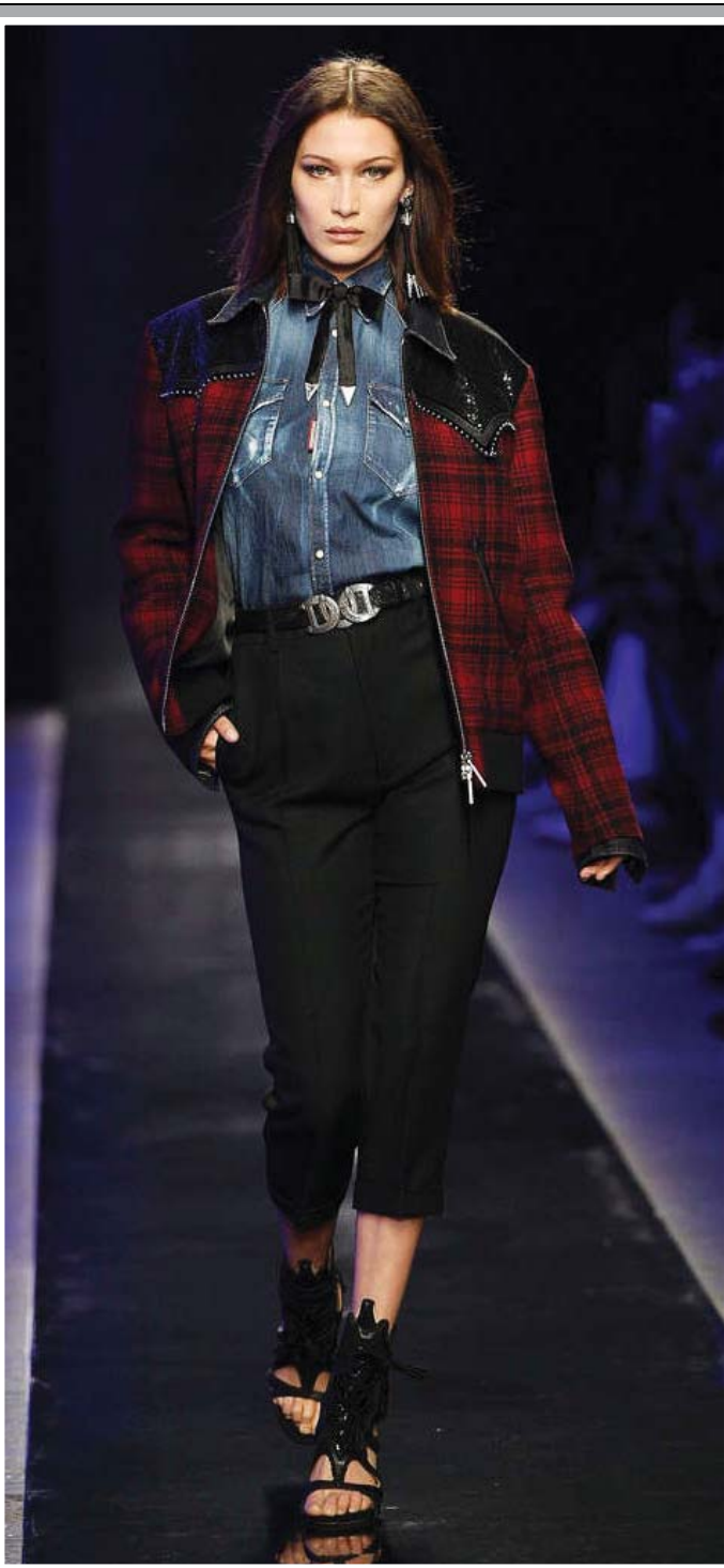
FIERCE BELLA: Supermodel Bella Hadid walks the runway in a fashion show in Milan, Italy.