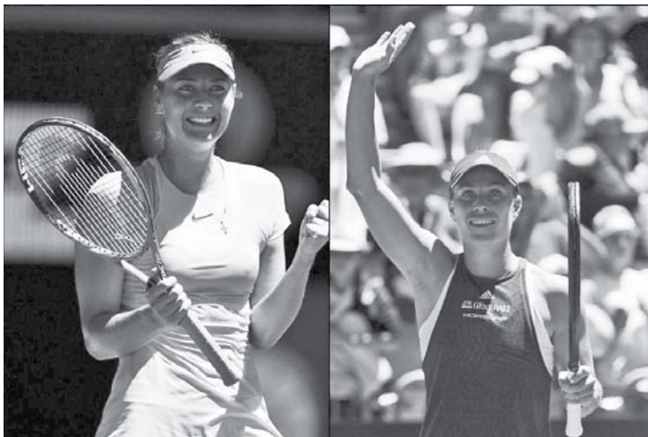
seed Anastasija Sevastova of Latvia or American Varvara Lepchenko.

The 2008 Melbourne Park champion, now ranked 48, battled past Germany's Tatjana Maria 6-1, 6-4 and will next play either 14th