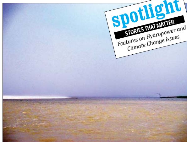
Teestamukh at Chilmari in Bangladesh where the Teesta joins the Brahmaputra

Features on Hydropower and Climate Change issues