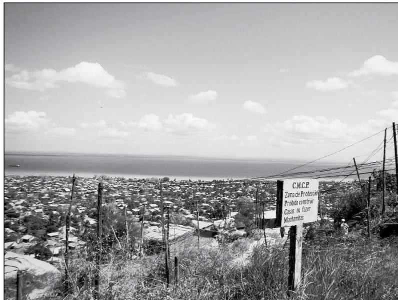
Pemba in northern Mozambique has seen a surge of new arrivals in step with investments to exploit off-shore gas deposits.

Our study also measured direct and indirect job-creation stemming from Mozambique's investment boom. We did this by linking projects