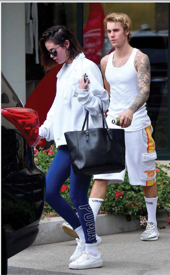
Fresh off their trip to Cabo San Lucas, Justin Bieber and Selena Gomez worked up a sweat when they attended a Pilates class at Hot Pilates in West Hollywood.

Fans will likely remember the collaboration between Zayn Malik and Taylor Swift titled “I Don't Wanna Live Forever” from Fifty Shades Darker.