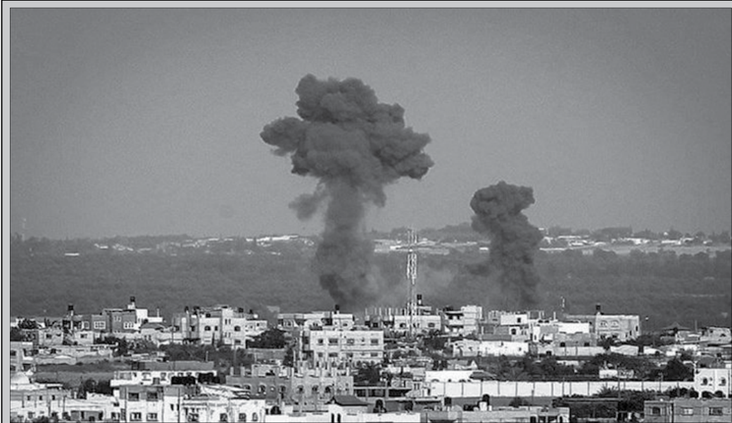
Israeli jets bombard Hamas positions in Gaza JERUSALEM, JAN 4 (AFP): Israeli jets bombarded Hamas bases in Gaza overnight in response to rocket fire from the Palestinian enclave, the military said today. "In response to the projectiles fired at southern Israeli communities throughout yesterday from the Gaza Strip, IAF (Israeli air force) fighter jets targeted a significant terror infrastructure in the Gaza Strip," Israeli forces said in a statement. Palestinian militants in Gaza have fired at least 20 rockets or

build a road inside the Indian territory in Siang district in Arunachal Pradesh has been resolved. The Chinese construction equipment seized by the Indian troops is expected to be handed over to People's Liberation Army (PLA) troops at a local commanders meeting. The series of meeting at various levels currently underway were between the two countries were aimed at resetting the relations back on track averting a further downturn in the bilateral ties, they said.