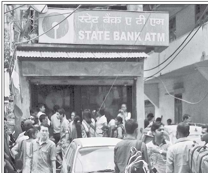
SINGTAM, 07 JUL: The only ATM operating in Singtam these days is the State Bank of India ATM. Even though there are more than 10 ATMs belonging to various banks at Singtam Bazaar, this is the only machine dispensing cash. [Yogen Thatal]

Adopting backyard poultry and smallscale semi-intensive poultry farming with Vanaraja in surrounding areas will reduce cost of meat production and help in nutritional and livelihood security of resource poor remotely located farmers of North Sikkim especially since agricultural activity is very low due to limited arable land and harsh climate which permits only one cropping season per year.