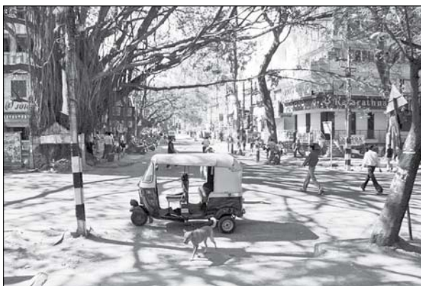
Bangalore has a long lasting love history with nature.

forefront of people's imaginations. But once piped water began to be provided in the 1890s, these water bodies began to decay. By the end of the 19th century, wells and lakes began to be polluted with garbage, sewage, and even corpses during times of epidemics and disease.