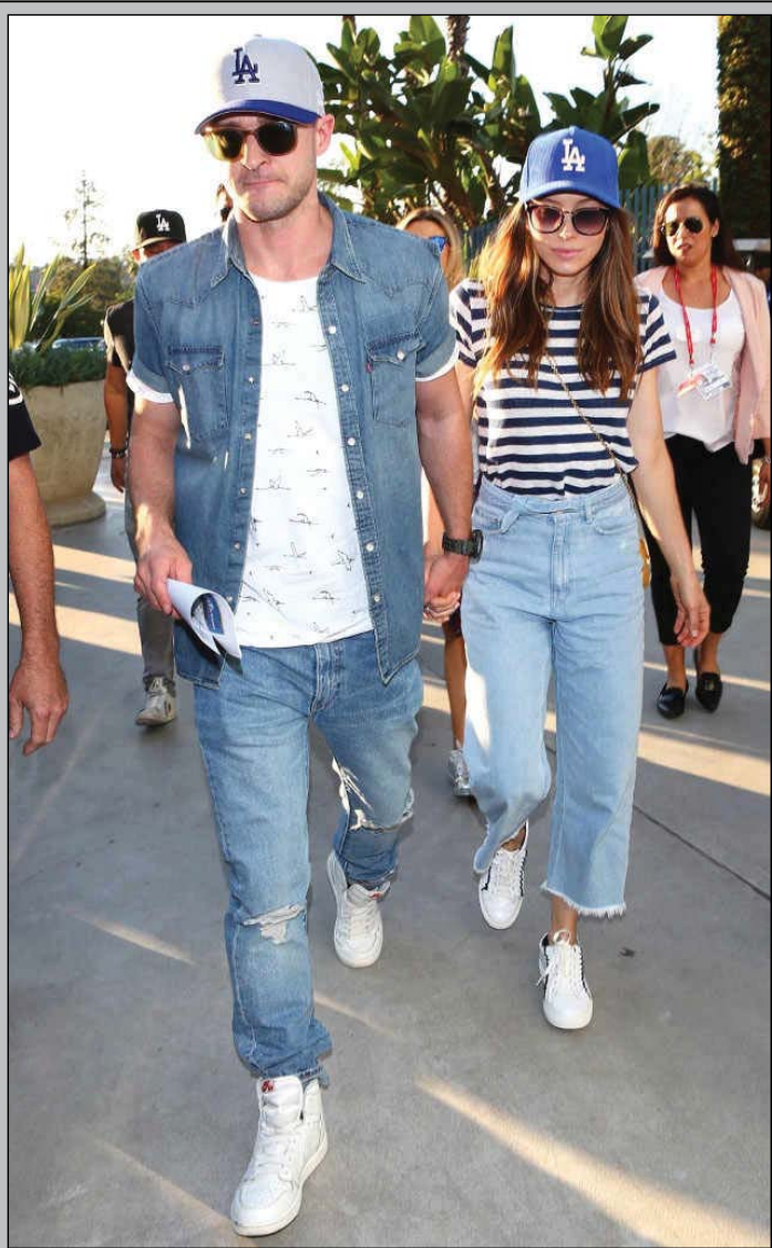
BLUE IS THE WARMEST COLOR: Justin Timberlake and Jessica Biel were spotted arriving to the World Series sporting their favorite Dodger gear. Timberlake was just confirmed to play the Super Bowl 2018 this week.