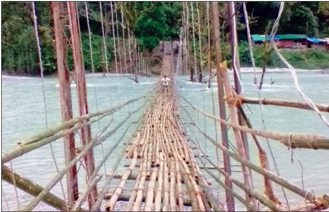
The makeshift bamboo bridge across Mantam Lake. This one, while serviceable for the dry winter months, will not be able to weather the monsoon, hence the need for a more robust footbridge across the lake.