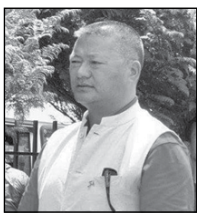
legislators met at Ming-