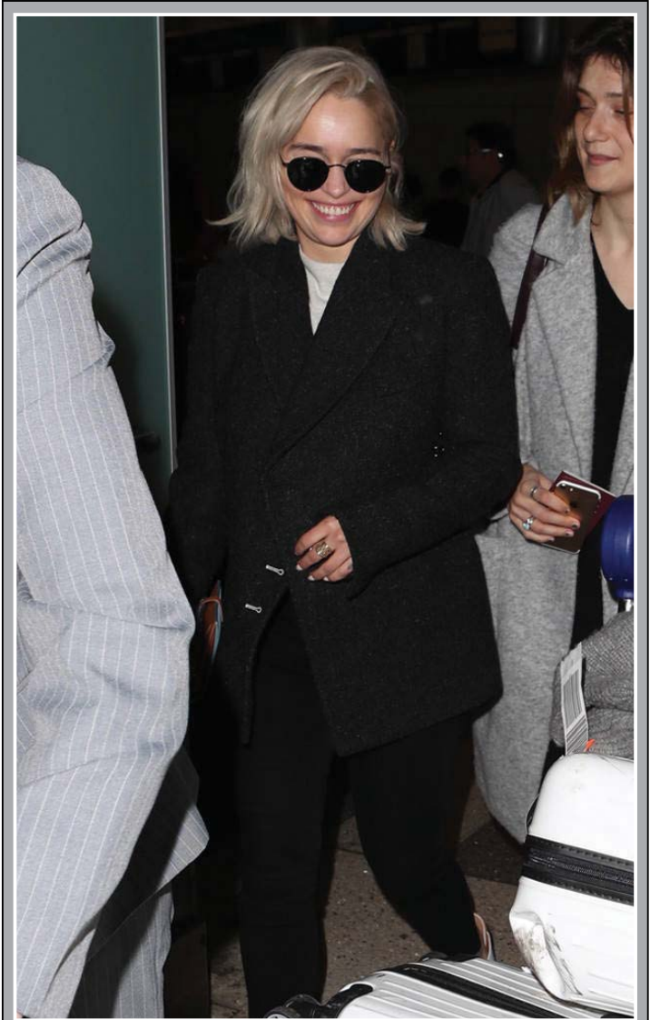
MOTHER OF SMILES: Game of Thrones actress Emilia Clarke is all smiles as she arrives in Los Angeles.

genres. 1948: Burma became an independent nation no longer under control of the British. Independence to Burma was originally granted by Japan in 1943 after Japan had temporary control over it. However, this land area was primarily turned into a Japanese military base at this time. Since then, this country has undergone quite a few changes-one of which is a name change in 1989. As of this date Burma was referred to as the Union of Myanmar. 1958: Sir Edmund Hillary, first man to conquer Mt. Everest, reached the South Pole, at the bottom of the world Friday. 2010: The world’s tallest building Burj Khalifa 2,716ft high with 160 floors opens in Dubai dwarfing the previous record holder, Taipei 101 1,666ft high in Taiwan.