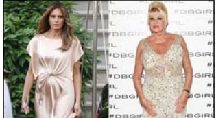
Well, this is super awkward. First lady Melania Trump's, 47, spokes-

Melania Trump just proved that she can feud just as well as her husband! She quickly tore into Ivana Trump, after Donald's ex went on GMA and called herself the 'first lady' while promoting her new memoir.