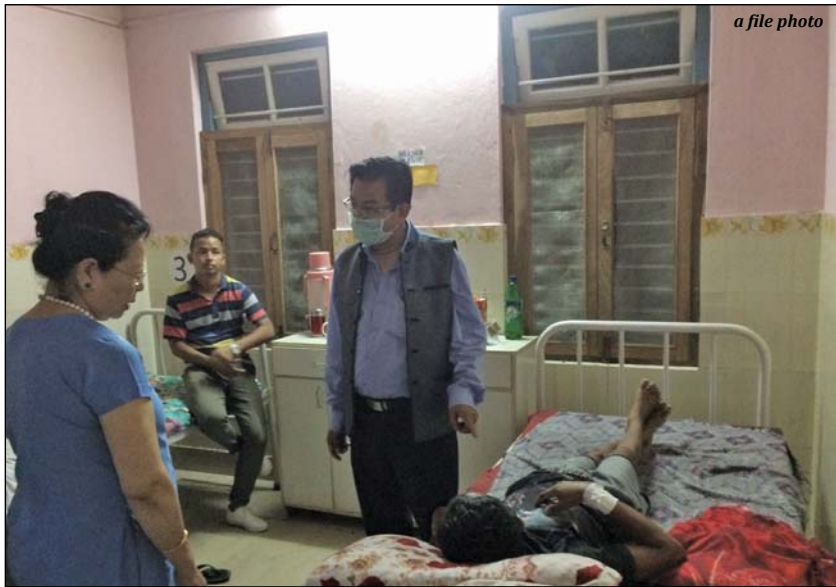
a file photo

Highlighting the plight of women and children, he had urged the court to direct the authorities to ensure that sanitation was maintained and clean drinking water was made available to Bhat Camp residents.