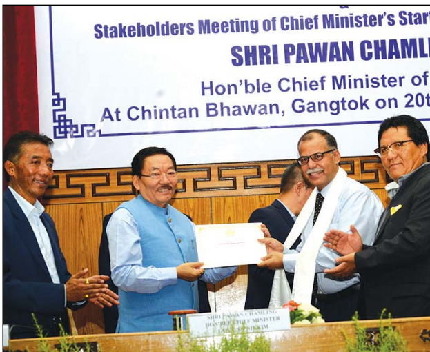
this year's Independence Day state level function. Today's meeting was the first follow-up meeting bringing the prospective beneficiaries and the fi-

GANGTOK, 20 SEPT (IPR): Chief Minister Pawan Chamling today chaired the inaugural stakeholders' meeting of Chief Minister's Startup Scheme (CMSS) here at Chintan Bhawan. The meeting was attended by Minister for Commerce and Industries, Ugen T Gyatso along with stakeholders ranging from senior officers from Banks and other financial institutions, Members of State Level Inter Institutional Committee on MSME, senior officers of the state government, upcoming entrepreneurs, and students from various colleges. It may be recalled that the CMSS was launched by the Chief Minister at