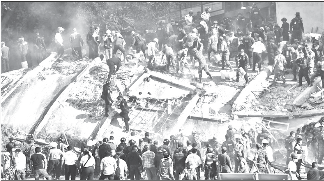
A 7.1 magnitude quake hit central Mexico hours after preparation drills were held on the anniversary of a devastating 1985 earthquake that killed more than 5,000 people in Mexico City. At least 216 people have been killed in Tuesday’s quake, including 117 in the capital, authorities confirmed.