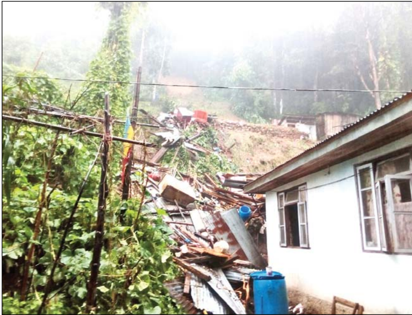
landslide. In another incident at Ramaram Khorlong in South Sikkim, a 14-year-old boy was washed away along with his house in a mudslide. According to a press

SUMMIT REPORT NAMCHI, 20 SEPT: South Sikkim saw three landslides this morning resulting in six deaths and damage to some houses. In the first instance, three people out of which two children, one 11-year-old boy and a 15-year-old girl along with a 21-year-old woman died and two people were injured in a landslide at Ghurpisey in Namchi at around 02 a.m. The injured people were immediately rushed to Namchi District Hospital for immediate medical attention. In the second incident at around 03 a.m. a hillock gave way at Upper Bokrong ward under Kateng-Namphok Gram Panchayat Unit in South Sikkim killing a 20-year-old woman and her 02-year-old daughter who were reportedly washed away by the