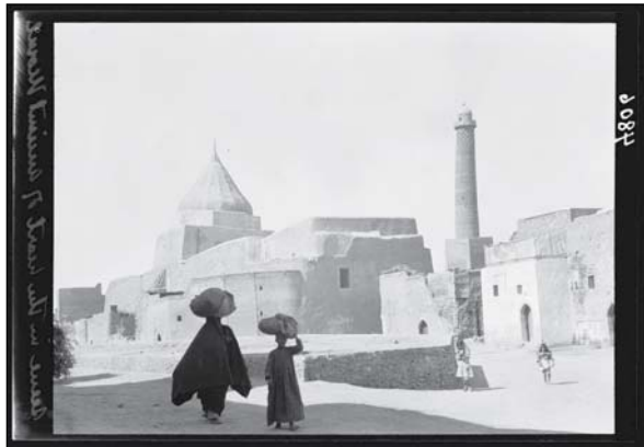
A 1932 photograph showing the minaret of the Great Mosque of al-Nuri, Mosul