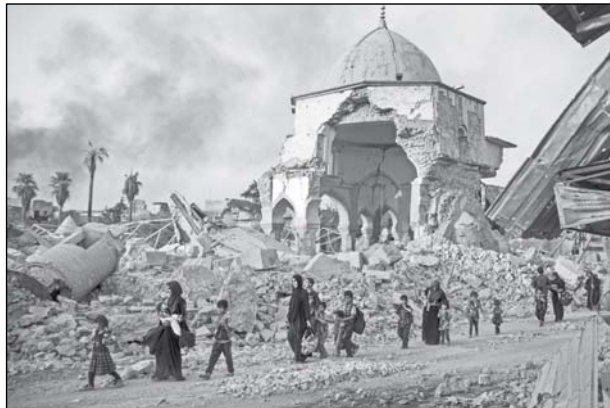
The heavily damaged al-Nuri mosque