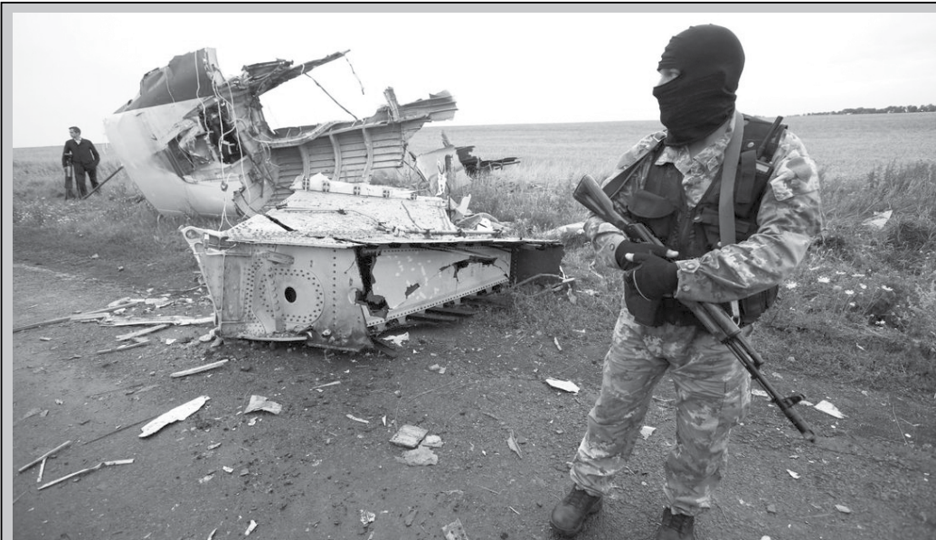
The missile that brought down Malaysia Airlines Flight 17 over Ukraine four years ago was from a Russian military convoy, Dutch investi-gators have said. Detailed analysis of video images has established that the Buk missile which hit the plane came from a Russian-based military unit. All 298 passengers and crew died when the plane came down over eastern Ukraine on 17 July, 2014.

hyperinflation projected by the IMF to reach 13,800 percent this year and dire shortages of food and medicine. Hundreds of thousands of people have fled the country to escape the growing deprivation. Washington has previous-ly slapped sanctions on Mad-uro and his senior aides, and banned US entities from buying any more debt from Caracas or state oil company PDVSA. The European Union said it was also weighing new sanctions after the election was marred by “irregulari-ties” and failed to meet inter-national standards. Caracas is facing increasing international isolation, with the United States, the Europe-an Union and the 14 countries of the Lima Group -- which includes Argentina, Brazil and Canada -- refusing to recognize the election result.