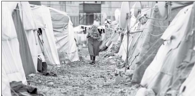
Women in crisis settings, such as refugee camps and war zones, are particularly likely to experience sexual assault.