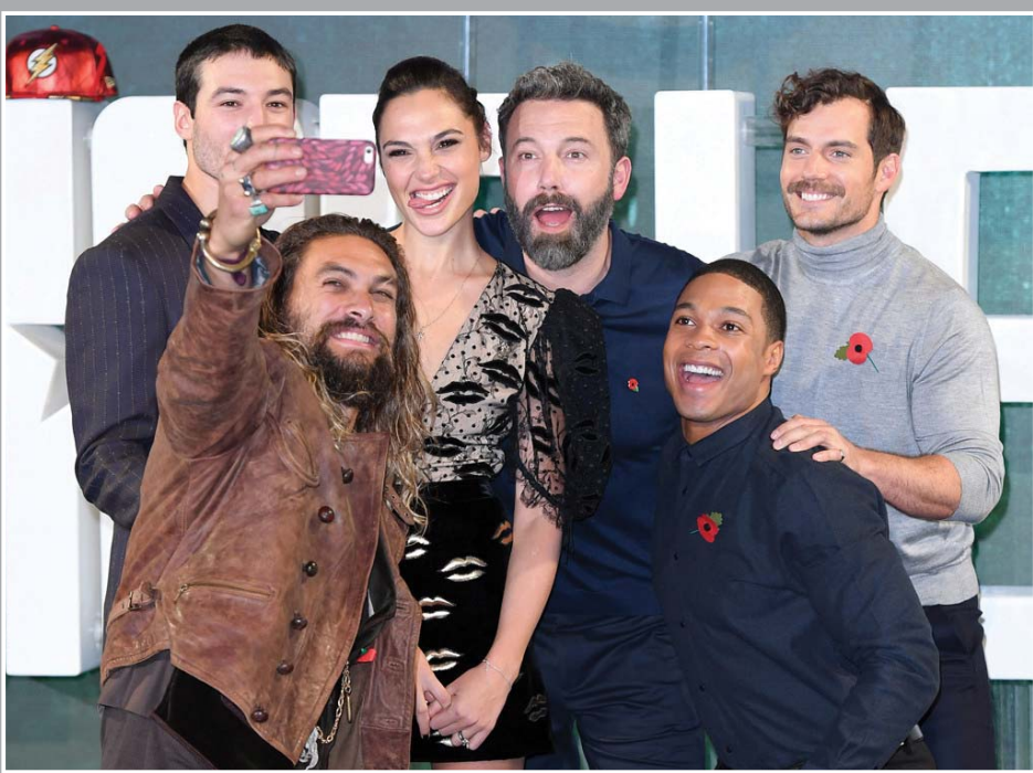
HEROES ALL IN: Jason Momoa [Aquaman], Ezra Miller [Flash], Gal Gadot [Wonder Woman], Henry Cavill [Superman], Ray Fisher [Cyborg] and Ben Affleck [Batman] are all smiles posing for a selfie during the Justice League photocall in London.