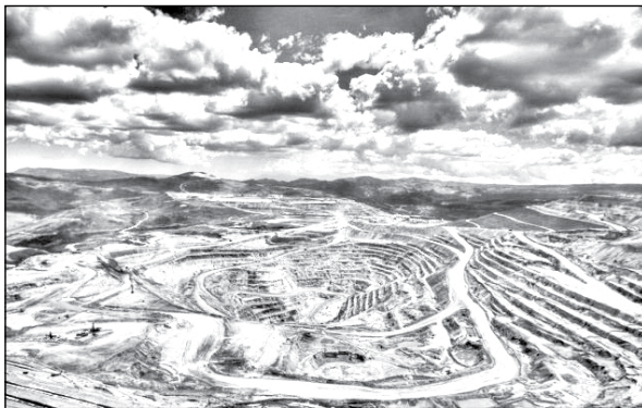
Open pit gold mines, like the massive Yanacocha mine in Peru bring grave social and environmental impacts to traditional peoples, whose rights are frequently ignored.

move will benefit ordinary Brazilians. This is not the first gold rush into this area, and the Amazon still has high indices of poverty and many other challenges.