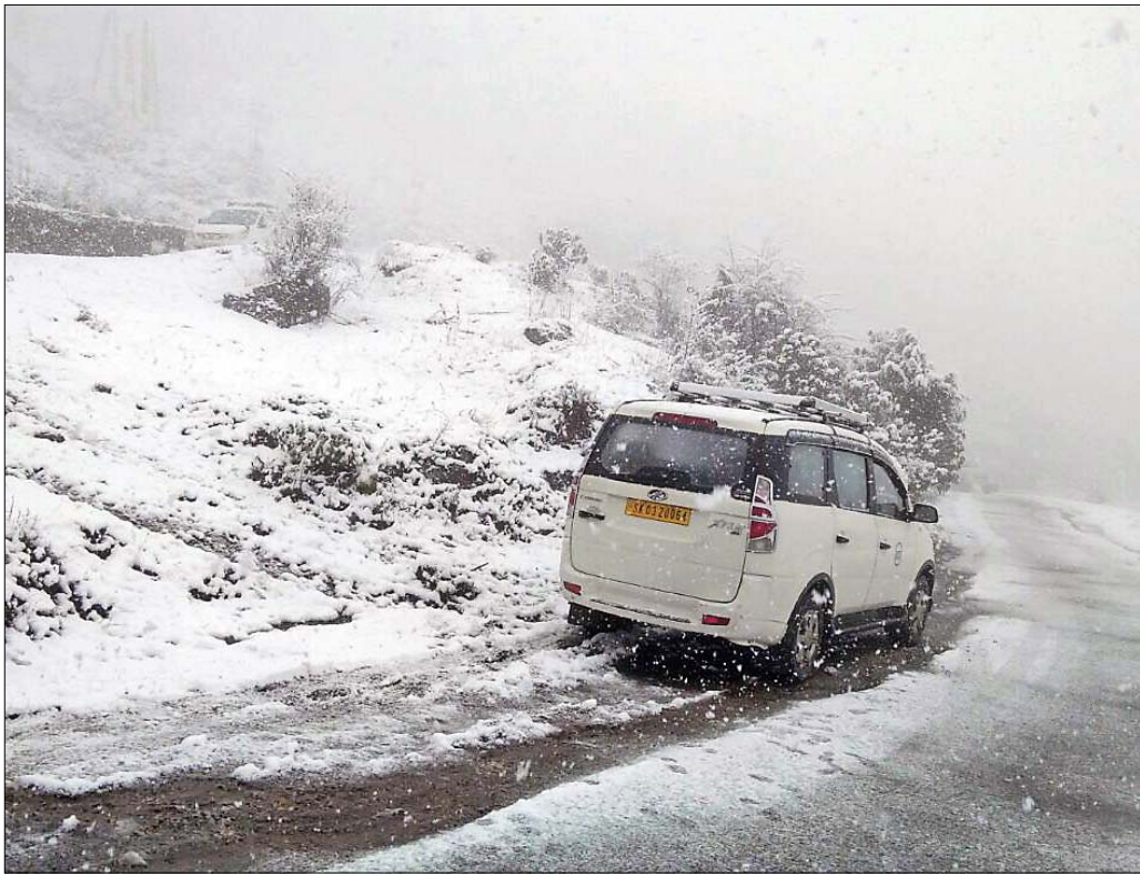
SPRING'S HERE, BUT SNOW STILL FALLS: Mercury across Sikkim dipped sharply on Saturday after high hills like Lachung and Yumthang in North Sikkim experienced snowfall while mid and low hills were chilly and wet [with intermittent rain]. Yumthang and Lachung were covered with snow (pic above) with minimum temperature dropping to -04°C.