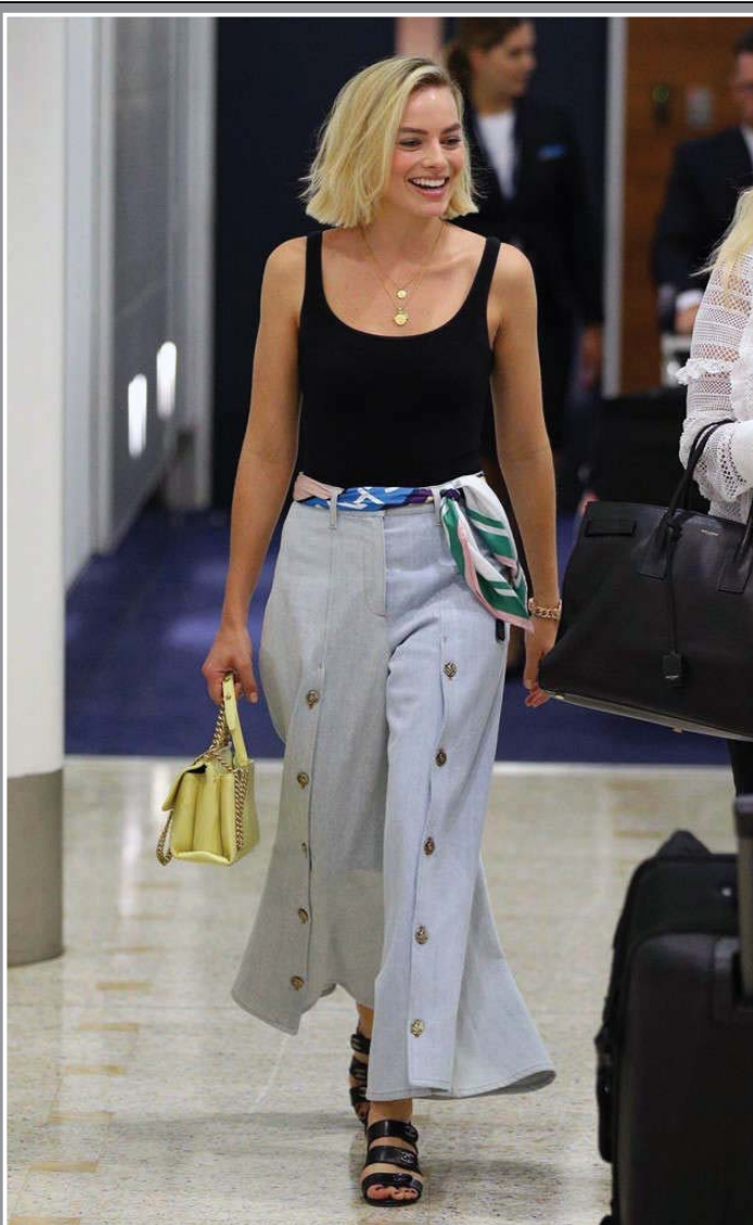
JET SETTER: Academy Award nominee Margot Robbie arrives all smiles at Sydney airport.

Despite its service not being available in India, there already are several thousand users in the country who use Spotify via VPNs. Spotify said that the awareness of its brand among users in India is already high, alluding to the fact that the company would be able to achieve organic growth in India.