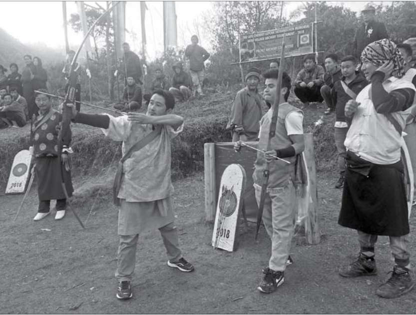
Winners of the 02nd Late Chendey Lepcha Tathangchen Memorial Inter Village Archery Tournament will receive a cash prize of Rs 40,000 while the runners-up team will receive a cash prize of Rs 30,000. The date of the final clash is yet to be announced.