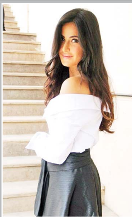
JUGHEAD: Tiger Zinda Hai actress Katrina Kaif poses while promoting her 14 July release Jagga Jasoos

1833: In a Speech to the House of Commons Sir Thomas James Babington Macaulay, Baron of Rothley, later the right Honourable Lord Macaulay placed a 13 points Bill pertaining to the administration of India. The Bill also emphasized about the highhandedness of the East India Company and had made a sharp criticism about the commercial and political functions of the Company. Mr. Charles Grant, President of the Board of Control, moved that the Bill for effecting an arrangement with the India Company, and for the better government of His Majesty's Indian territories.