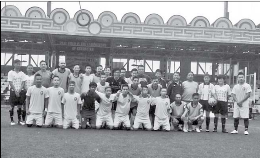
Dzsoma FC will take on in the first match at 12:30 p.m which will be followed by another match between Sadarain Football Club and Chujachen Sports Academy.