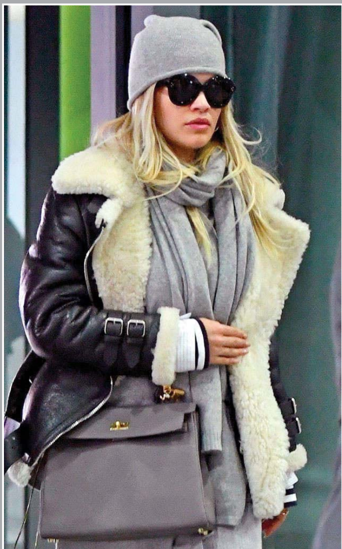
BUNDLED UP: Fifty Shades Freed actress and singer Rita Ora is ready for chilly weather in London