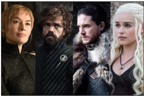
nal battle for the Iron Throne go down. Sophie Turner who plays

Fans took to Twitter to react to the news and express their excitement for the the highly-anticipated last season. GOT devotees also didn't hold back from sharing their disapproval of having to wait more than a year to see the fi-