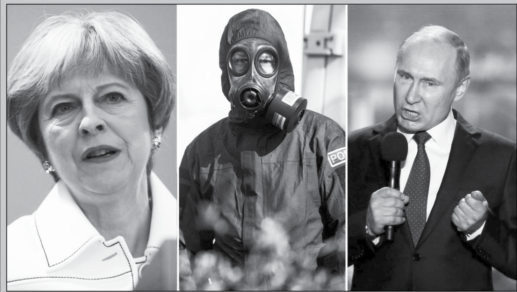
The Government is preparing further moves against Russia following a day of tit-for-tat action over the poisoning of former spy Sergei Skripal. Speaking at the Conservative spring forum on Saturday, Theresa May said Britain "would never tolerate a threat to the life" of its citizens, or others in the country, from the Russian government. "This act of Russian aggression is the very antithesis of the liberal and democratic values that define the United Kingdom," she said. The pledge comes as 23 British diplomats based in Russia begin packing their bags as they are expelled from the country in retaliation for Russian representatives being told to leave the UK.

Violence has risen in the Buddhist-majority country since 2012, with some headline Buddhist groups accusing Muslims of forcing people to convert to Islam and vandalising Buddhist archaeological sites.