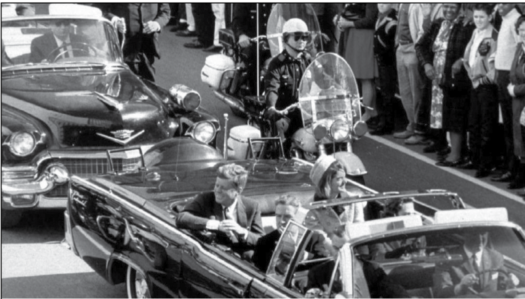
Allegations that Lee Harvey Oswald was connected to the CIA are "totally unfounded", according to the latest documents released on the assassination of John F Kennedy. Almost 3,000 documents relating to the November 1963 murder of the US President have been made public over the past few weeks. The third collection, released on Friday, contained 676 files. Among them was a CIA memo from 1975, which said that agency records had been searched to see if Oswald, who had fired the fatal shots at the President, had been used by the agency or connected to it in "any conceivable way". The conclusion was that there was no connection between Oswald and the intelligence service or any other US agency.

Those who maliciously modify the lyrics, or play or sing the national anthem in a distorted or disrespectful way in public, can be detained for upto 15 days, and even be held criminally liable, according to the law.