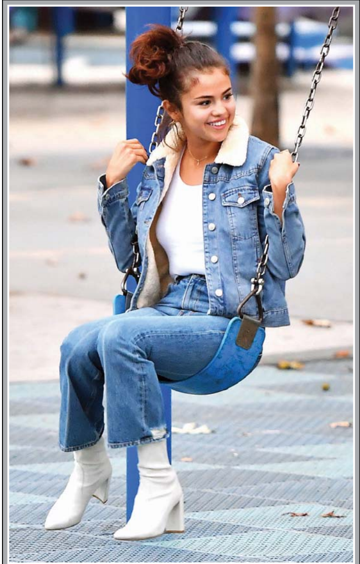
IN THE SWING OF THINGS: 'Bad Liar' songstress Selena Gomez had some fun on a swing while at a Burbank park.