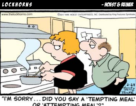
"I'M SORRY... DID YOU SAY A 'TEMPTING MEAL' OR 'ATTEMPTING MEAL'?"

2000 - U.S.A. - - O.J. Simpson: O.J. Simpson, a man charged of killing his wife and daughter tried to sue his former lawyer for breach of contract. However, this could not be proven, so the charge was dismissed by the judge. Simpson had faced legal trouble for a number of years regarding the murders he had allegedly committed. 2006 - Iraq - - Saddam Hussein Sentenced To Death: Saddam Hussein been been convicted of crimes against humanity and sentenced to death by hanging in the al-Dujail trial for his role in the massacre of the 148 Shi'as in 1982 2013 - India - - India Launches Mars Orbiter: India has successfully launched their Mars Orbiter Mission, hoping that they will become the fourth country to reach Mars. The spacecraft is expected to travel for three hundred days before reaching the planet.