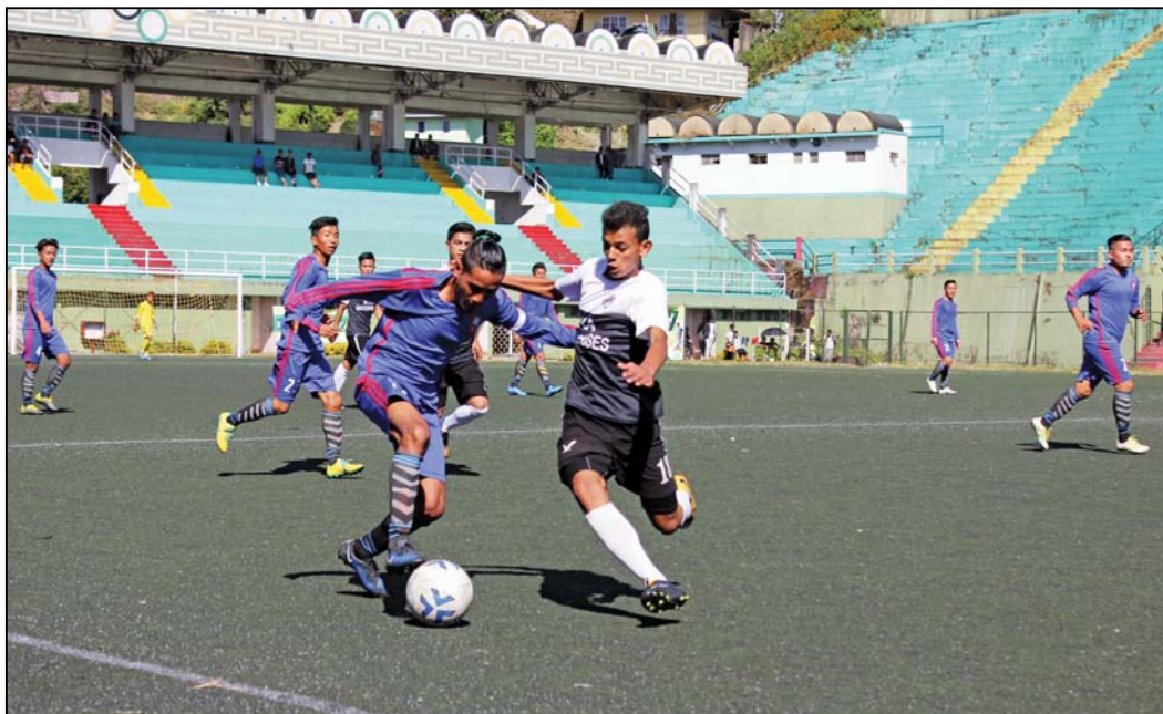
SUPER CUP KICKS OFF: Play 24/7 Super Cup 2017 began today here at Paljor Stadium. The top four teams of the Sikkim Premier Division League are competing for the Super Cup, finals of which will be held on Monday. (turn to pg03 for detailed report)