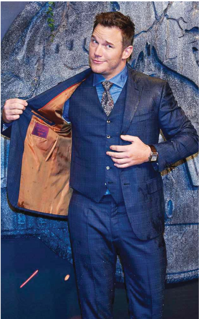
MAKE WAY FOR STAR LORD! Actor Chris Pratt takes off his wet jacket after getting caught in the rain at the Jurassic World: Fallen Kingdom premiere in Madrid, Spain.

Will Smith and Nicky Jam, together with Kosovo singer Era Istrefi, will perform the official 2018 FIFA World Cup Russia song, according to published reports and independent sources. The track will be produced by Diplo and is slated for release May 25.