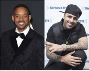
Although there are multiple songs

Will Smith and Nicky Jam, together with Kosovo singer Era Istrefi, will perform the official 2018 FIFA World Cup Russia song, according to published reports and independent sources. The track will be produced by Diplo and is slated for release May 25.