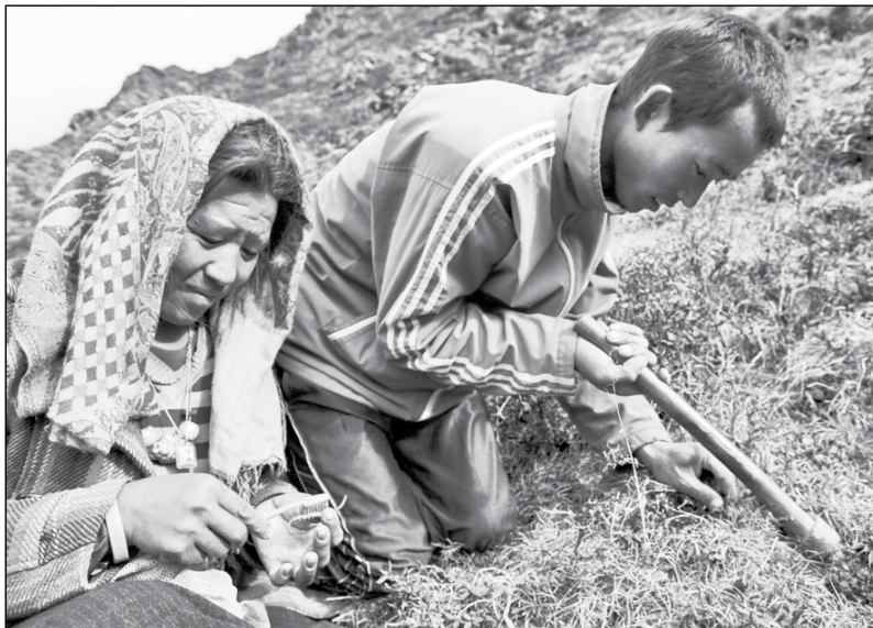
A picker uses a hoe to carefully dig out the soil, and the yarsagumba is pulled out slowly. The soil is put back again so the field is not ruined for next year’s harvest. Another picker cleans the fungus with a toothbrush.

As Lewis Carroll writes in his book Through the Looking Glass , “It takes all the running you can do,