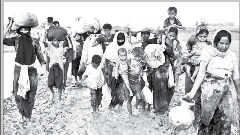
UN says 87,000 refugees arrive in Bangladesh from Myanmar: A total of 87,000 mostly Rohingya refugees have arrived in Bangladesh since violence erupted in neighbouring Myanmar on August 25, the United Nations said today. Thousands of the stateless Muslim minority have poured over the border since the latest round of fighting broke out, piling pressure on the already overcrowded camps in Bangladesh.

born." Malala, who is set to begin her philosophy, politics and economics (PPE) course at Oxford University, was made the youngest ever UN Messenger of Peace earlier this year and was also the youngest person to win the Nobel Peace Prize aged 17 in 2014. She was shot in the head on her way home from school after writing her anonymous diary about life under Taliban rule in the Swat Valley of northwest Pakistan. She became internationally known after the incident and relocated with her family to Birmingham for further rehabilitation. "Other countries, including my own country Pakistan, should follow Bangladesh's example and give food, shelter and access to education to Rohingya families fleeing violence and terror," she added. Last week, UK foreign secretary Boris Johnson had also urged Suu Kyi to curb the violence against Rohingya Muslims in Myanmar. "Aung San Suu Kyi is rightly regarded as one of the most inspiring figures of our age, but the treatment of the Rohingya is alas besmirching the reputation of Burma," he had said. Soldiers and armed residents have been accused of carrying out a killing spree against Rohingya Muslim men, women, and children in Chut Pyin village, leaving more than 200 dead. About 58,600 Rohingya civilians have left Myanmar and fled to neighbouring Bangladesh.