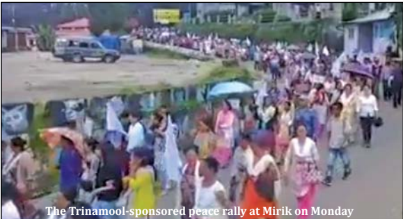
The Trinamool-sponsored peace rally at Mirik on Monday