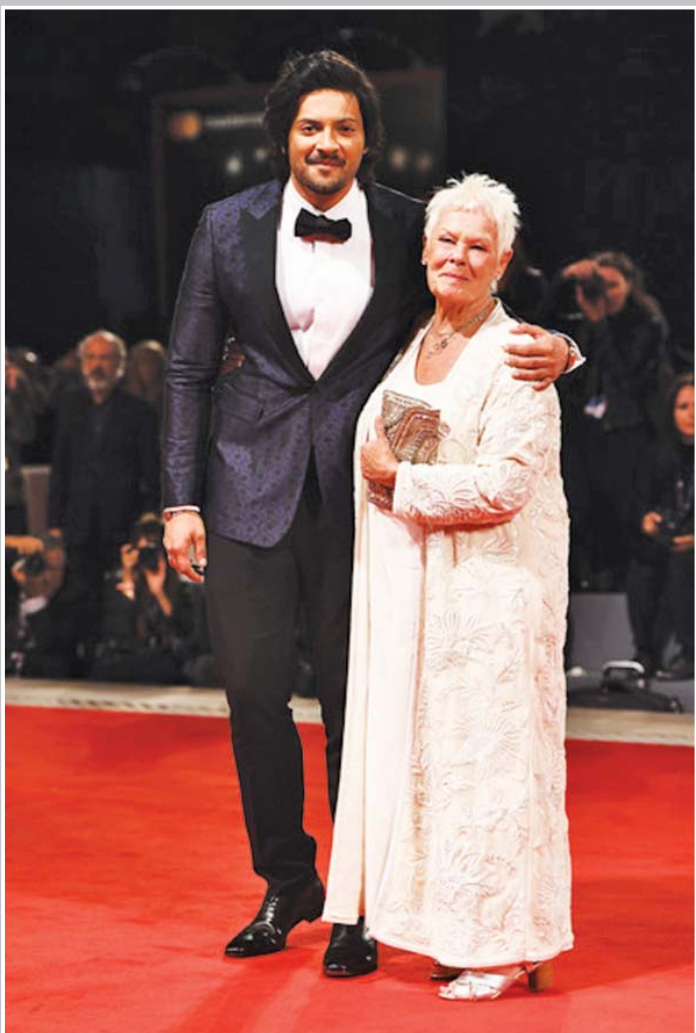
A 130-YEAR-OLD STORY FOR OUR TIMES! Judi Dench and Ali Fazal walk the red carpet ahead of the screening of their movie "Victoria & Abdul" and Jaeger-LeCoultre Glory to the Filmmaker Award 2017 during the 74th Venice Film Festival in Venice, Italy.