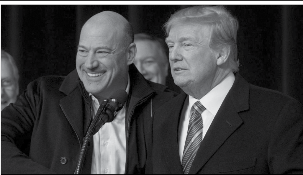
Donald Trump's economic adviser has quit his role in the White House over the president's trade tariffs. Gary Cohn, viewed as a voice for Wall Street, resigned after battling with the president over his plans to impose hefty steel and aluminium import tariffs. The 57-year-old, who was a key architect in Mr Trump's tax reforms, is expected to finalise his exit over the next three weeks. Mr Trump tweeted: "Will be making a decision soon on the appointment of new Chief Economic Advisor. Many people wanting the job - will choose wisely!"

Contact Summit TIMES at 9832556698, 9832369520 news@summit- times.com advertse@sum- mittimes.com summittmes16@ gmail.com