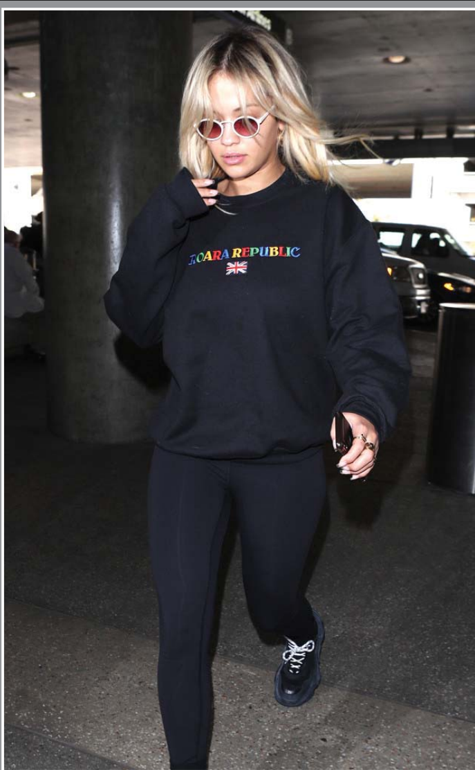
ALL BLACK EVERYTHING! Singer Rita Ora looked cozy departing LAX sans makeup.

As recently as four years ago, the ceremony had an audience of 43.7m viewers - nearly twice as much.