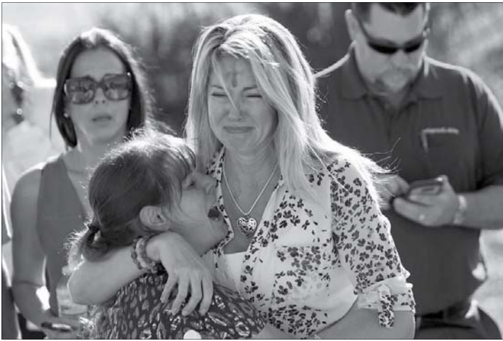
Parents wait for news after a shooting at Marjory Stoneman Douglas High School in Parkland, Florida, on Wednesday, Feb. 14, 2018.

Of course, society can think of students in different ways at different times. But the more teachers think of students as threats to be assessed, the less educators will think of students as individuals to nourish and cultivate.