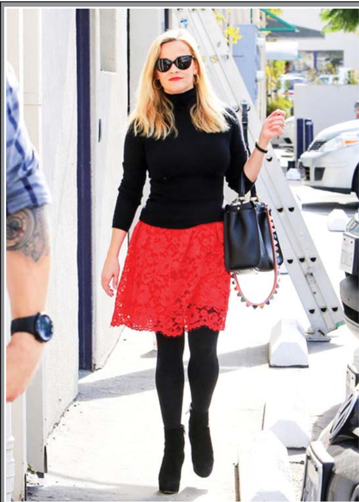
CHIC DONE RIGHT! Reese Witherspoon was back to her busy schedule as she was seen out and about in Brentwood, California.

Published by Penguin India, the book hit the bookshelves in December last year.