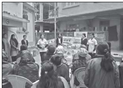
The programme members actively participated in the event and had personal interactions with the community students. Fifty members actively participated in the event and had personal interactions with the community students.

SUMMIT REPORT GANGTOK, 02 FEB: Batch of 2nd Year BSc Nursing students of Sikkim Manipal College of Nursing, Sikkim Manipal University, organized a mass health awareness programme at JNNURM Colony in Arithang, Gangtok today, an SMU press release informs.