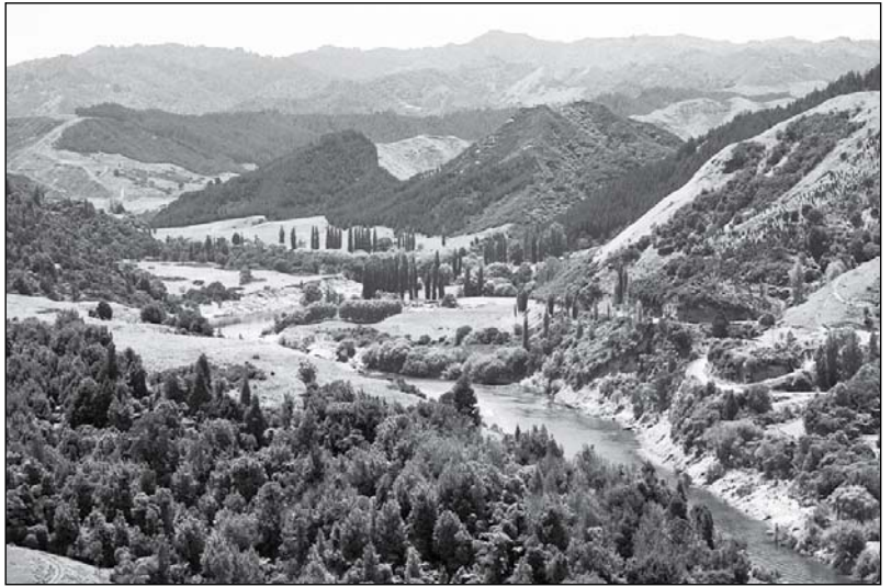
Whanganui river in New Zealand

Overall, however, Ecuador and Bolivia have seen mixed results. In both countries, extractive indus-