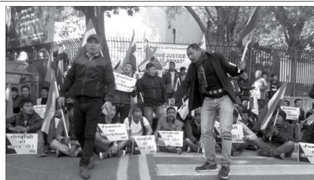
JAP YOUTH STAGE DHARNA IN NEW DELHI: Jan Aandolan Party youth wing stage dharna at Jantar Mantar, New Delhi in demand of separate state of Gorkhaland on Tuesday.