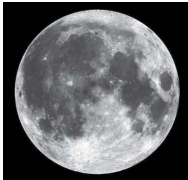
As long as clouds don’t get in the way, the view should be spectacular.

When a lunar eclipse happens, the moon appears to darken as it moves into the Earth’s shadow called the umbra. When the moon is all the way in shadow it doesn’t go completely dark; instead, it looks