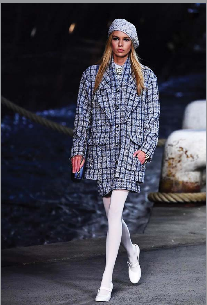
MANE ATTRACTION! Girlfriend of Kristen Stewart, Stella Maxwell, embraced ladylike light blue chic tweed co-ord as she strutted forth with her blonde locks billowed as she strutted forth at the Chanel Cruise 2017-18 collection show in Paris.