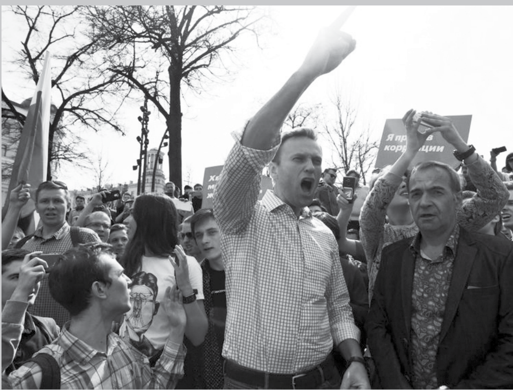
Protests against Vladimir Putin have taken place across Russia ahead of his inauguration for a fourth presidential term, with more than 1,200 people arrested. Police removed Russian opposition leader Alexei Navalny from a rally in Moscow’s Pushkin Square, carrying him off by his arms and legs. Officers used batons against protesters, with many in the crowd chanting “Putin is a thief!” and “Russia will be free!” Part of St Petersburg’s famous avenue Nevsky Prospekt was blocked off by police as a crowd of roughly 1,000 demonstrators marched through the city.