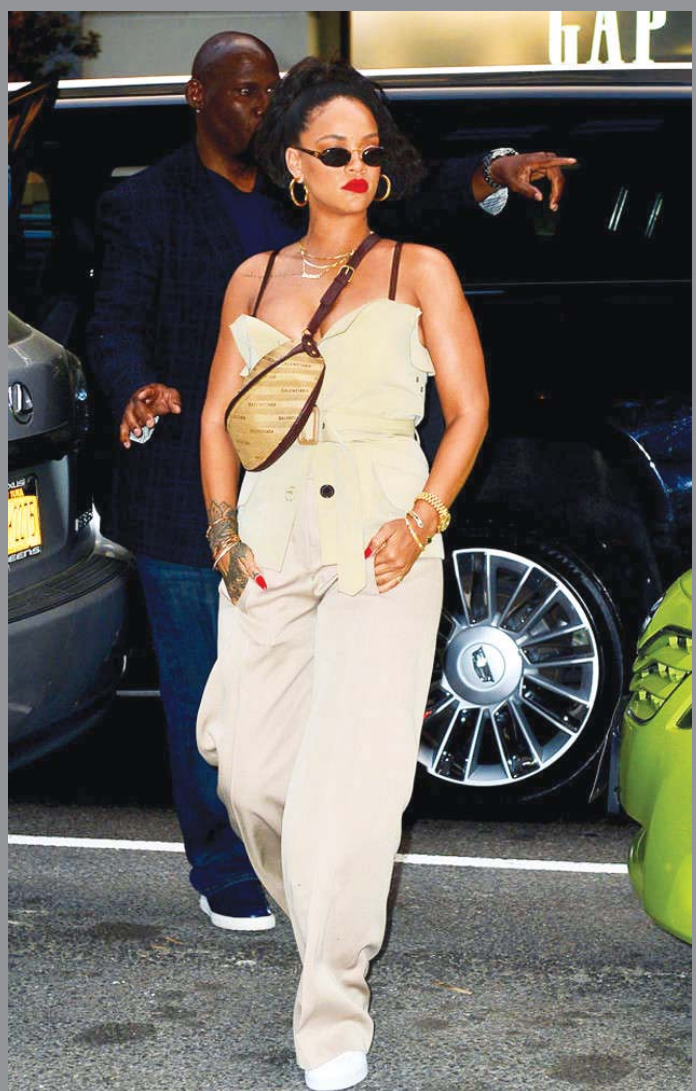
SINGER RIHANNA LOOKS CHIC IN A BEIGE JUMPSUIT IN NEW YORK CITY.