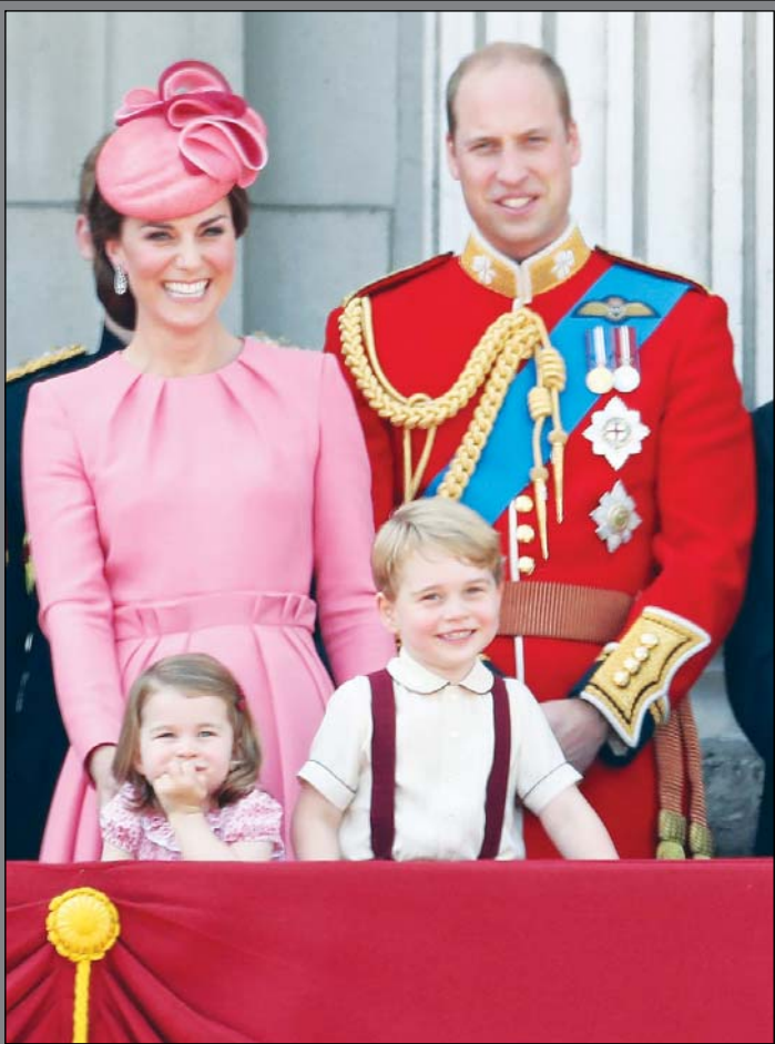
A ROYAL AFFAIR: Duchess Kate, Prince William and their children, Princess Charlotte and Prince George, enjoyed the Trooping the Colour parade in London.