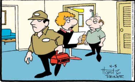
"HE TACKED ON AN EXTRA HOUR'S LABOR FOR YOUR ADVISING HIM."