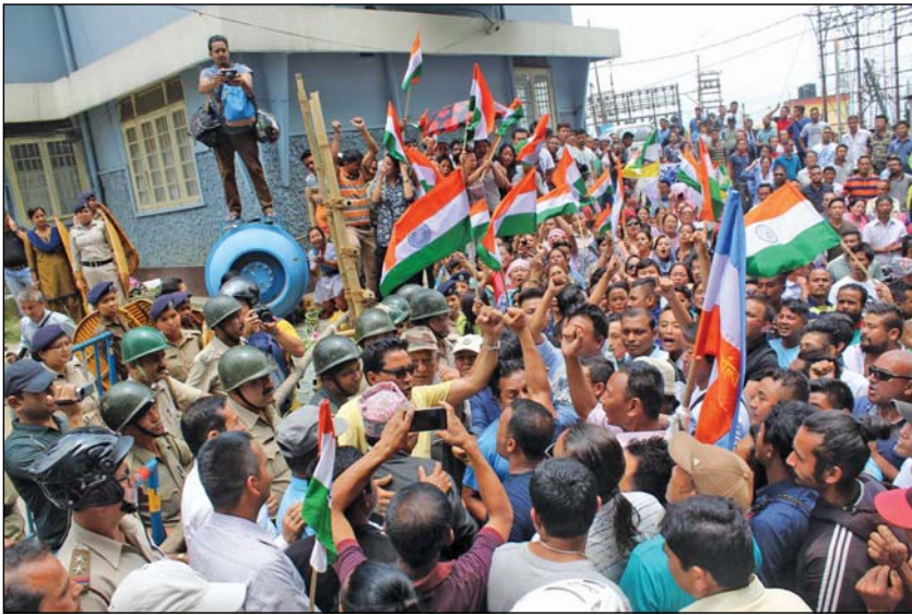
A file foto of a people's rally outside the DM's office in Kalimpong

The protesters, carrying black flags and the tricolour, assembled at Chowkbazar. They shouted slogans in support