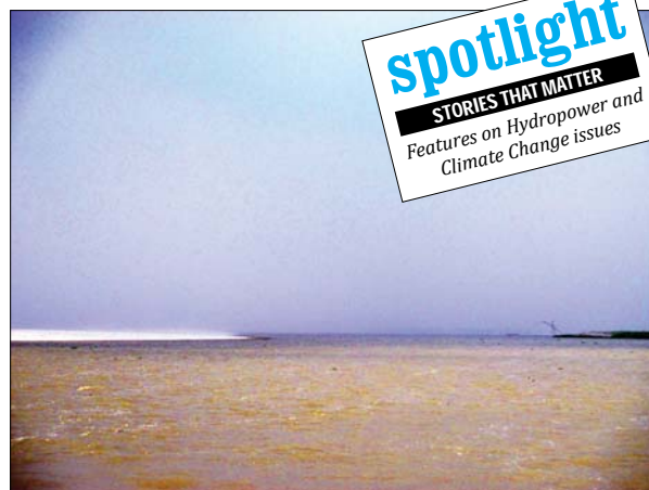
Teestamukh at Chilmari in Bangladesh where the Teesta joins the Brahmaputra

spotlight STORIES THAT MATTER Features on Hydropower and Climate Change issues