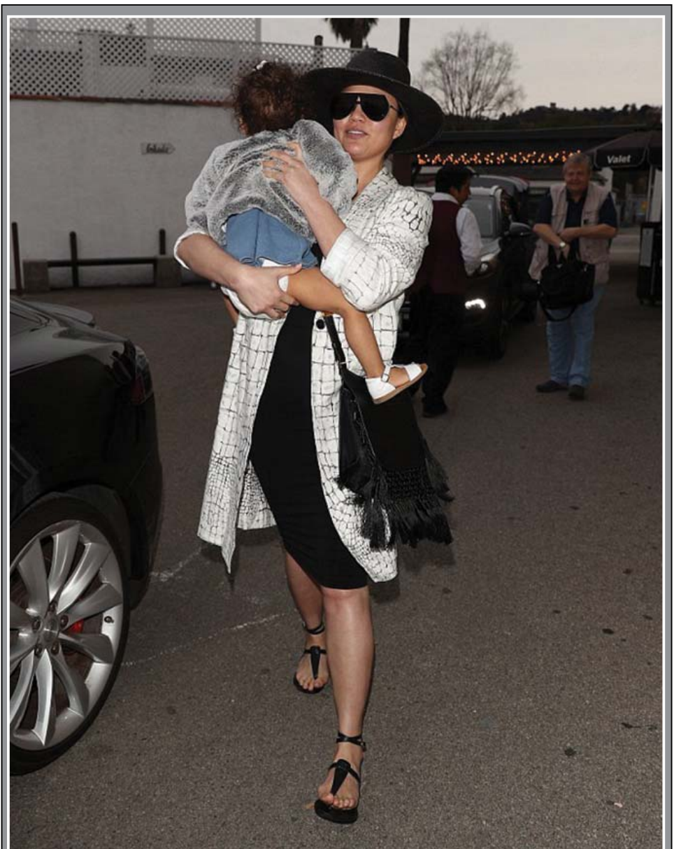
QUALITY TIME! Pregnant Chrissy Teigen cradles cute daughter Luna as she flaunts her chic maternity style in form-fitting dress and reptile print coat on dinner date.

The film is set to release on 08 Nov 2019.