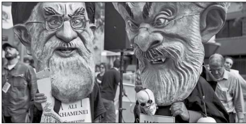
Iranian voters, fed up with politics as usual, have demanded the ouster of both Supreme Leader Ali Khamenei and President Hassan Rouhani.

Ever since the 1979 Iranian Revolution cre-