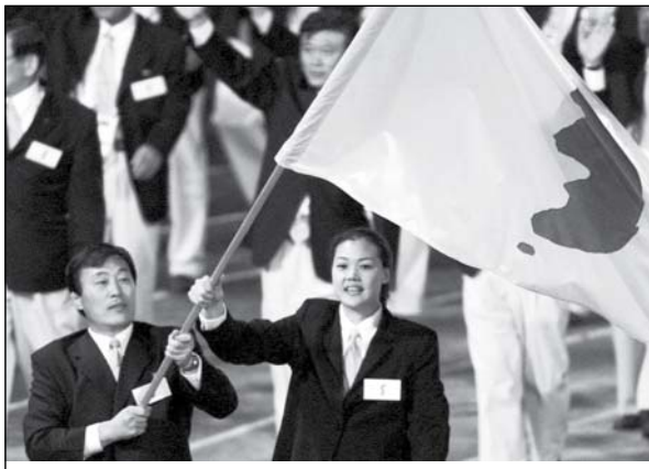
A flag with Korean peninsula unification symbol at the opening ceremony of the Sydney 2000 Olympic Games.

Most South Koreans are not optimistic about reunification. According to a 2017 Unification Perception Survey conducted by Seoul National University’s Institute for Peace and Unification Studies, 24.7 percent of South Koreans don’t think that unification is possible. Only 2.3 percent of South Korean respondents believe that unification is