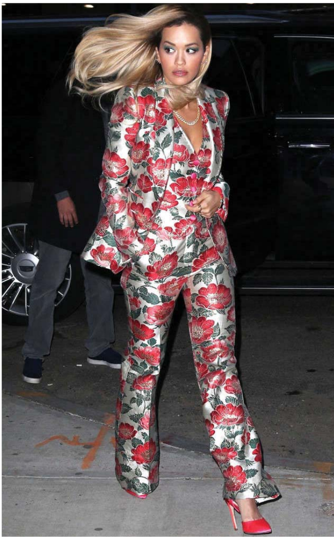
FLOWER POWER: Singer Rita Ora steps out in a floral suit on the streets of New York City.