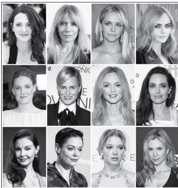
Hollywood women who have spoken out against sexual harassment.

These cutesy terms also diminish the agony women face when deciding whether to make a formal complaint to an authority. Those who have been victimized report fear of reprisal or of being disbelieved, and feel shame, guilt and embarrassment. These fears and reactions are evident across women's recent accounts. Many spoke of years of torment, fear,