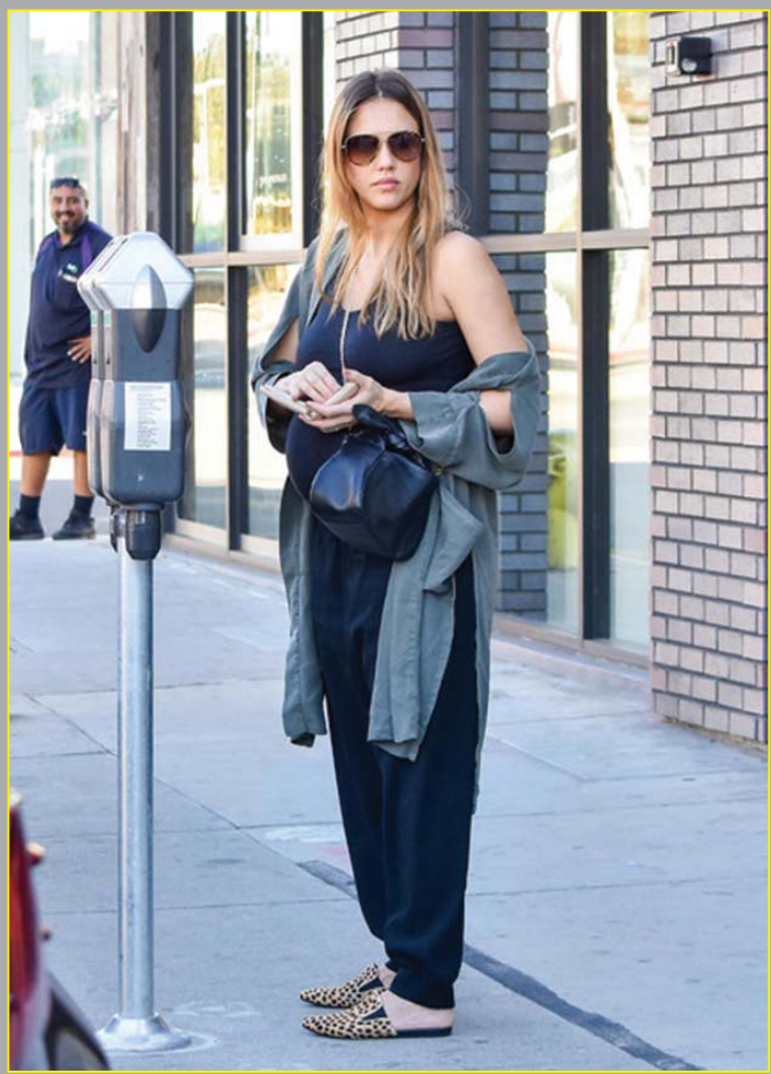
READY TO POP! Business mogul and mother of two with one on the way, pregnant Jessica Alba shows off baby bump during pre-Thanksgiving shopping spree as she was spotted on a solo shopping trip in Los Angeles.