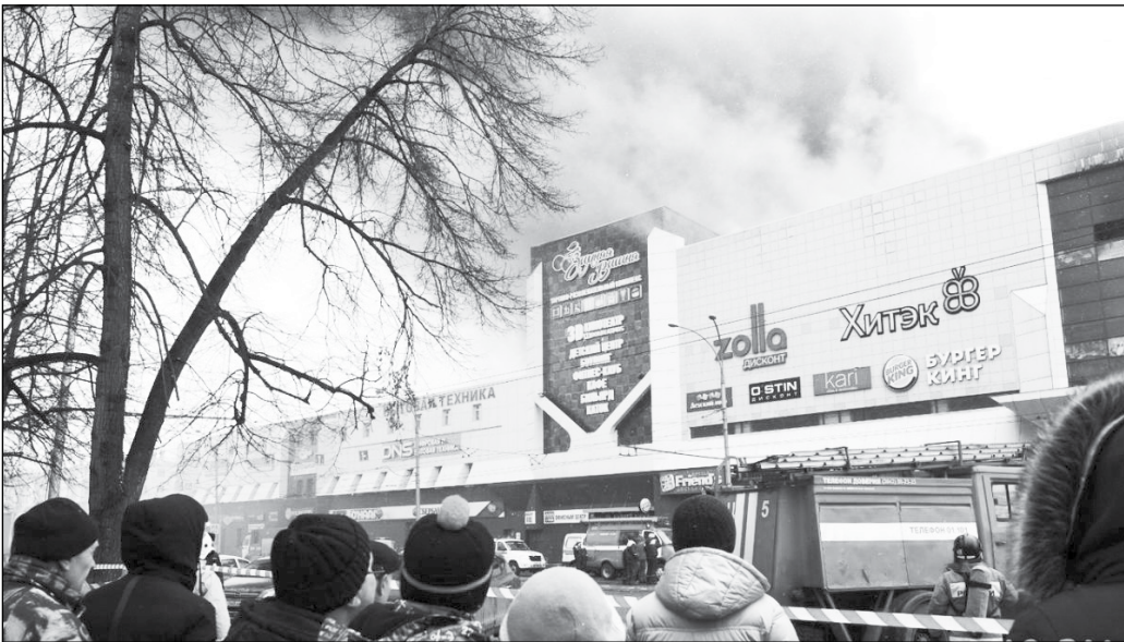
At least 53 bodies have been recovered from a fire that swept through a busy shopping centre in an industrial city in Siberia, Russian news agencies said today. Many people are also still missing from the blaze that broke yesterday in the city of Kemerovo, the agencies quoted emergency services as saying. A previous toll put the number of dead at 37 with nearly 70 missing, including 40 children.